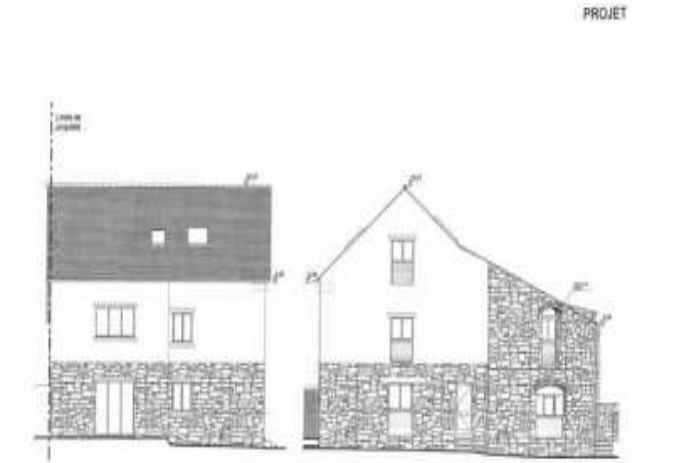
Elevation Sud - Ech.: 1/100