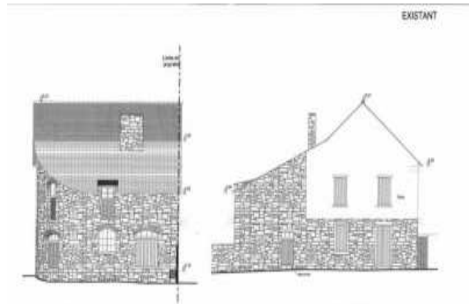
Elevation Nord - Ech.: 1/100