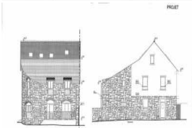
Elevation Nord - Ech.: 1/100