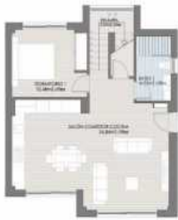
PLANTA BAJA E: 1/75