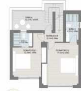
PLANTA PRIMERA E: 1/75