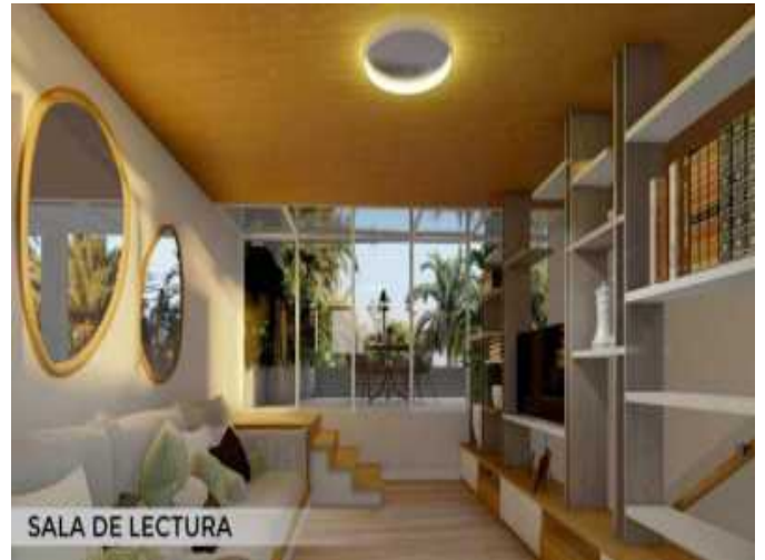
SALA DE LECTURA