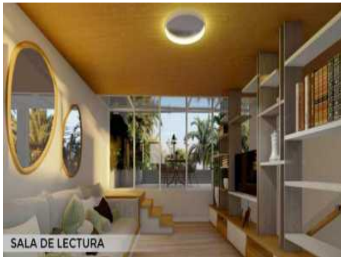
SALA DE LECTURA