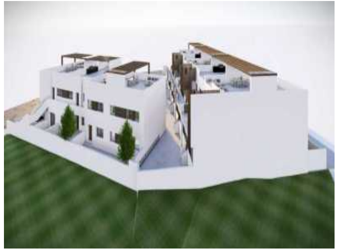
VIVIENDA TIPO Nº10 Y 12 - 3 DORMITORIOS