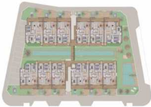
Figure 10-11 First Floor