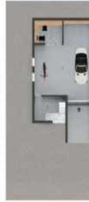
Planta Baja / Basement