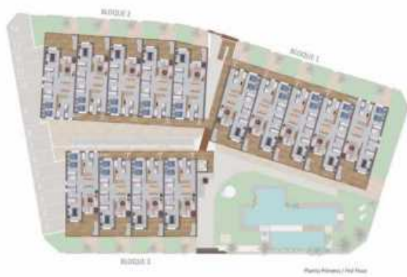
Parkside Meadows / 1st Floor