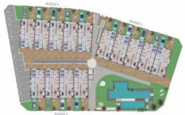
Planta Área / Ground Plan