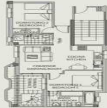
PLANTA BAJA LOW LEVEL

ÁTICO COMPLEX / DUPLEX PENTHOUSE 3 DORMITORIES / 3 BEDROOMS PLANTA 6 a / 6 th FLOOR ESCALERA 4 / STAIR 4