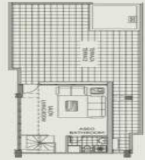
PLANTA ALTA TOP FLOOR