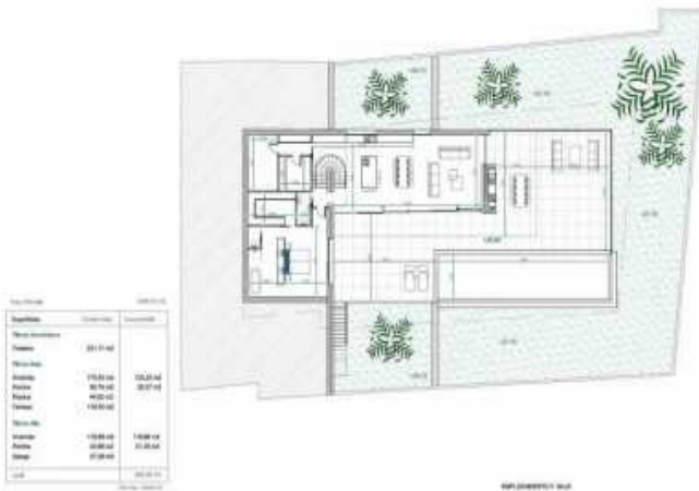
EMPLANAMENTO 1 - 1/20