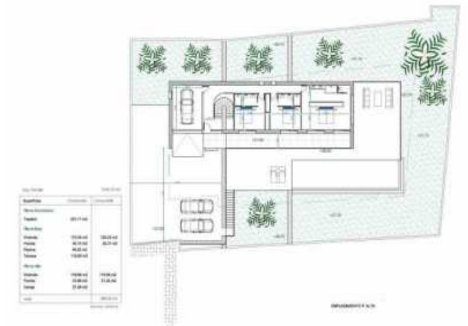
EMPLANAMENTO 2 - 1/20