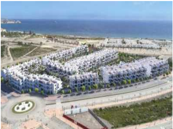
2 Bedrooms Bungalow With Solarium F2 Floor