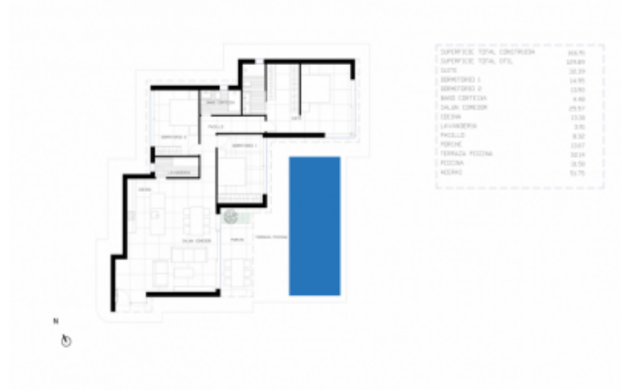
PROYECTO: MARIVILLA TITULO PLANO: PLANTA BAJA DISTRIBUCIÓN FECHA: 05-07-2021 ESCALA: 1:100 PLANO Nº: 2