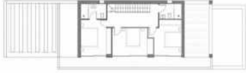
PLANO PLANTA PRIMERA DISTRIBUCION