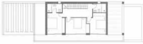
PLANTA PLANTA PRIMERA DISTRIBUCION