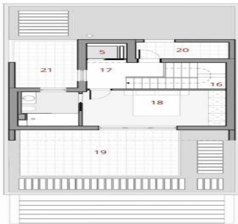
SECOND FLOOR HOUSE BUILT SURFACE (TERRACES ARE NOT INCLUDED) 37.69 m 2