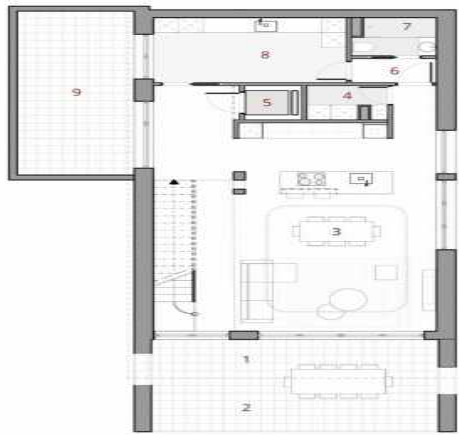
GROUND FLOOR HOUSE BUILT SURFACE (TERRACES ARE NOT INCLUDED) 77.40 m 2