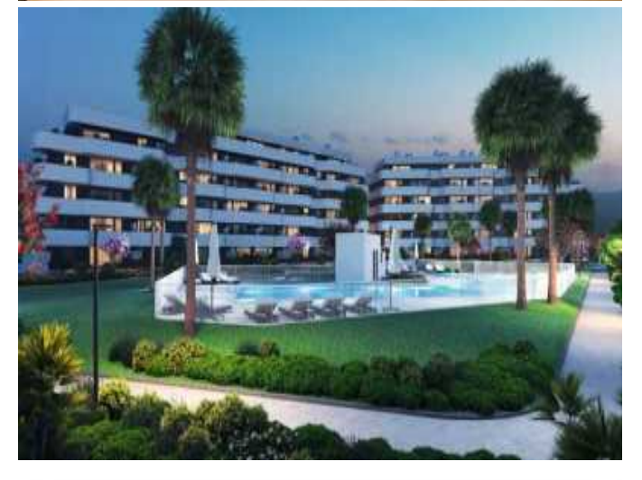
VIVIENDA DE 1 DORMITORIO