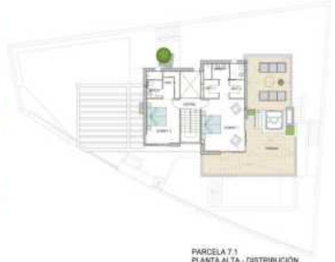
PARCELA 7.1 PLANTA ALTA - DISTRIBUCION

0 1 2 3 4 5 6 7 8 9 10 m Esc. Total planta: 1/50 0'0"