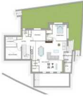
PARCELA 7.1 PLANTA SOTANO - DISTRIBUCION

0 1 2 3 4 5 6 7 8 9 10 m Esc. Total planta: 1/50 0'0"