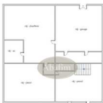
Rez de Jardin