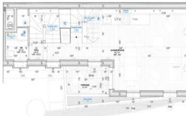
Surélévation d'un bâtiment en RDC R+1