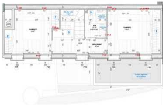
Surélévation d'un bâtiment en RDC R+2