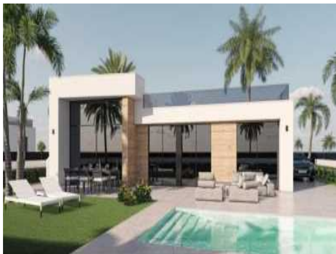
VILLA A (2 bedrooms / 2 bathrooms)