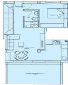
TIPO D ÁTICO

TIPO C: TOTAL CONSTRUIDA: 82.39 TOTAL ÚTIL: 69.42