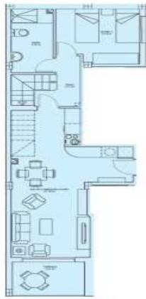
TIPO C PRIMERA PLANTA