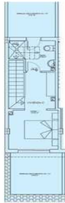
TIPO C ÁTICO

TIPO C PRIMERA PLANTA: Superficie construida: 62.53 m 2 Superficie útil: 50.82 m 2 TIPO C ÁTICO: Superficie construida: 22.84 m 2 Superficie útil: 18.77 m 2 TIPO C TOTAL CONSTRUIDA: 85.37 TOTAL ÚTIL: 69.59